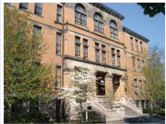
A Pine Street housing location.

The $200,000 award will go towards creating more housing for long-time homeless men and women. ❖